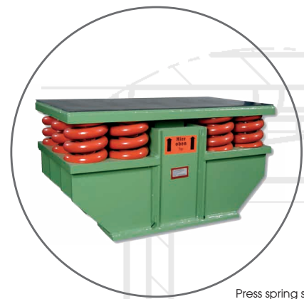
Press spring support for loads of up to 250 tons