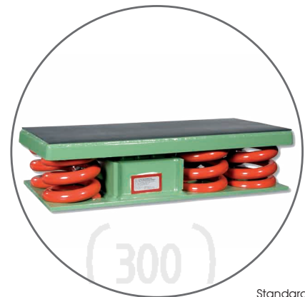
Standard spring support with viscous damping