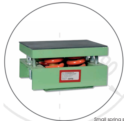
Small spring support for loads of up to 10 tons